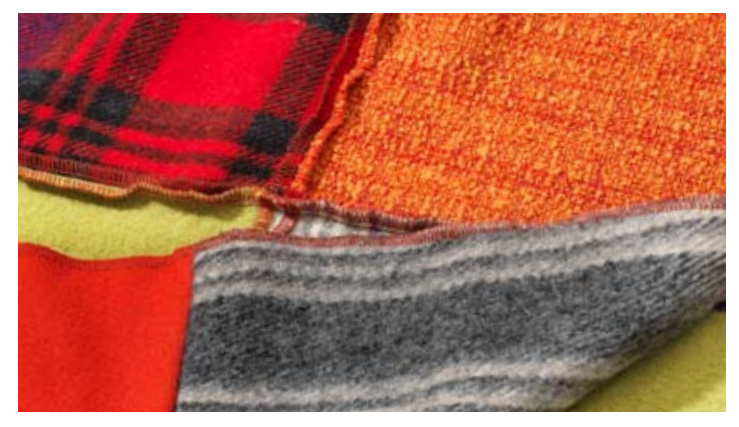
Overlock stitches look so professional you'll be tempted to turn wrong sides right.

The Exclusive SEWING ADVISOR® feature on the HUSKYLOCK™ s25 machine instantly sets the best stitch length, differential feed, and thread tension for the chosen stitch and recommends needles and more for perfect results. Simply enter the type of fabric you are sewing and the settings change automatically.